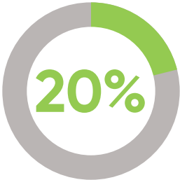
Office and administrative support