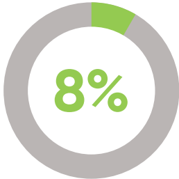
Personal care and service occupations