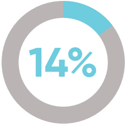
Education, training and library