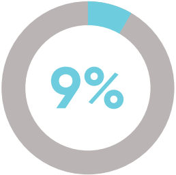
Sales and related occupations